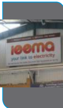
Glow Sign Board II